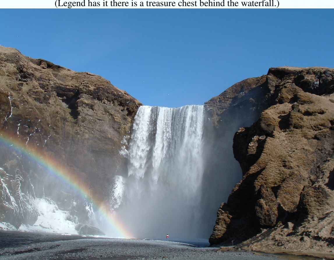
Figure 1: Skógarfoss, Iceland (Legend has it there is a treasure chest behind the waterfall.)

Personally, I believe a major reason for the irreproducibility of bioinformatic results is a lack of basic statistical considerations in the design of such experiments. I have had experience with pharmaceutical clinical trials since 1998. Results from those trials are highly reproducible. There is no doubt a main reason for the reproducibility is these trials are designed and executed according to statistical design principles (randomization, replication, blocking) set forth in the international guidance ICH E9. If one were to follow the same principles in designing microarray experiments, one would randomize the placement of the probes and the samples on the microarrays, take replicate samples from each patient, and hybridize samples from different groups to be compared in blocks. Such design considerations have hardly penetrated the realm of microarray experiments.